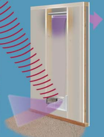
AS1 Room-To-Room Transfer Fan