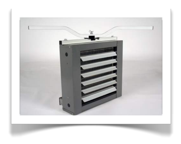
Quick Swivel SPECS QSWI4000

Applicable for residential or light commercial installations